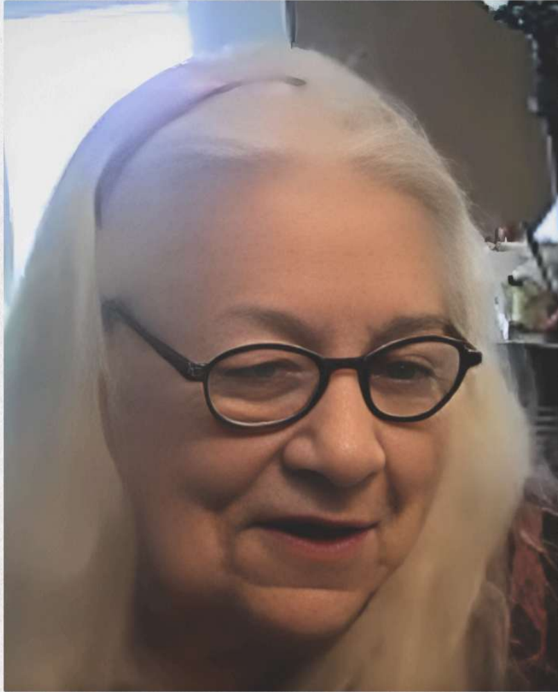
ACW ALUMNI, 1995