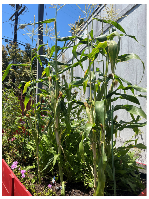
Growing tall in our gardens right now is corn. Lots of corn!