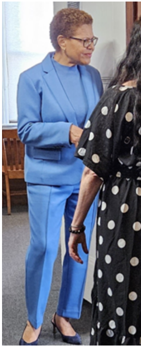
Mayor Bass discussing OP

Mayor Bass discussed ACW's services and challenges for those in recovery with ACW staff and board. She clearly understood the importance of substance abuse treatment with housing that transitions to outpatient services.