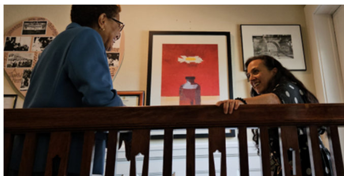
Mayor Bass admiring horseshoe from 1905 found under our building.

Mayor Bass valued our healthy eating program, our raised gardens promoting gardening and fresh veggies and the fact that we take care of our beautiful turn of the century buildings.