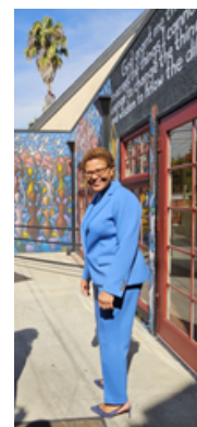
Mayor Bass admiring commemorative bricks