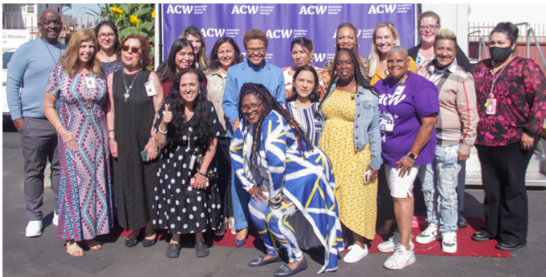
ACW Staff with Mayor Bass

We share the same goals to help Los Angeles women move from addiction, homelessness, criminal cases, physical and mental illnesses to recovery -health and wellness.