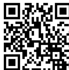
ECM - ACW Website

For more information, please visit our website or call 213.381.8500.