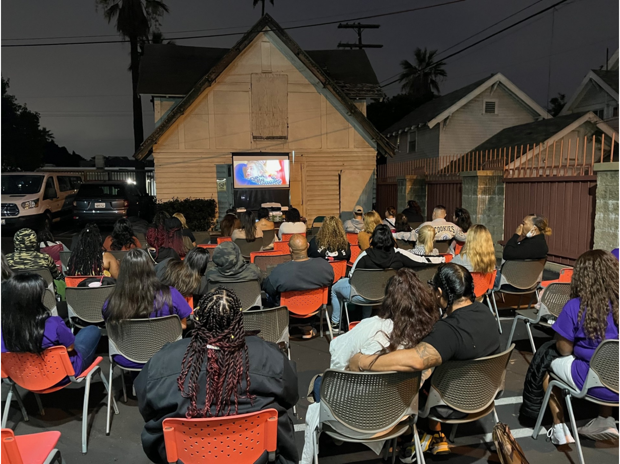
"Our American Family"